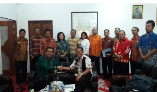
Sets of equipment to produce organic fertilizer provided by the Ministry of Industry to the group of community forestry at Sanggau