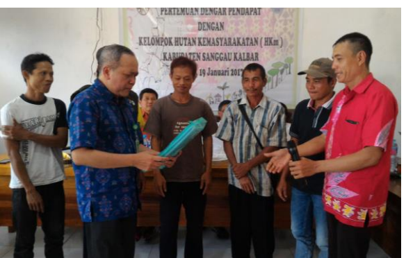
The groups of IUPHKm were facilitated to formulate the document for ten year plan (RKU) and Operational Plan (RO)