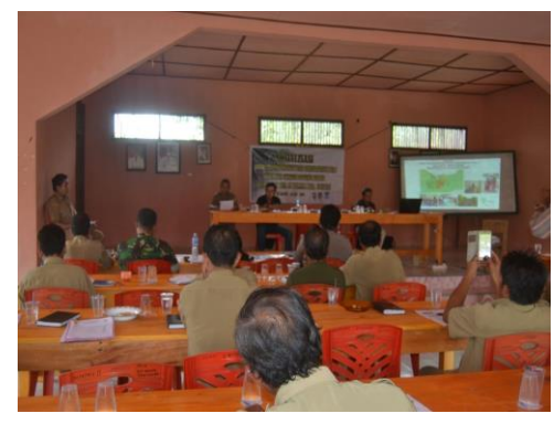
Submission of 5 (five) new proposals IUPHKm